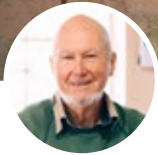
CONTACT: Stephen Hussey

Focus: Water and food security Grant: £30,000 (€35,400) Capacity building: £10,000 (€11,800)