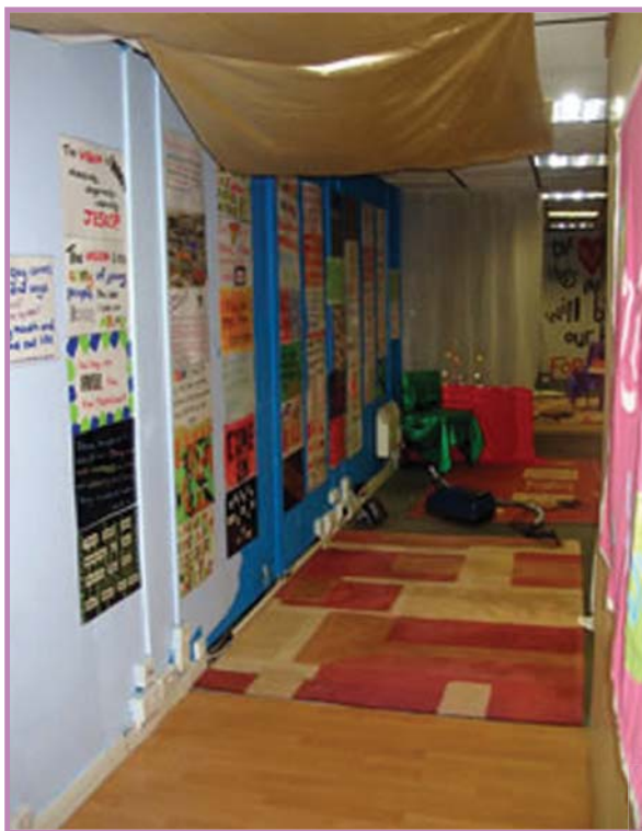
A part of the Prayer House in Newtownards.

One place of prayer was in the ruins of the Moravian church at Crossard, Co Clare (built 1794). It was Moravians whose faith influenced the Wesley's; pioneered the modern missionary movement and inspired 24.7 prayer.